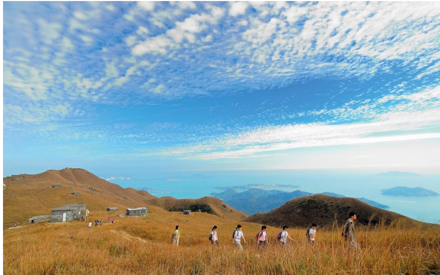
Hiking in Hong Kong.

From high-end shopping malls to bustling street bazaars, ancient Chinese temples to glass-curtained skyscrapers, neon-lit streets to verdant countryside, Hong Kong is a city of colour and contrast, a mesmerising medley of the ancient and ultra-modern, East and West. Beautiful country parks, interesting islands, world heritage geoparks are a short commute from urban areas.